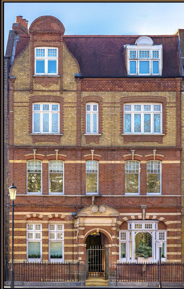
Thurloe Square LONDON